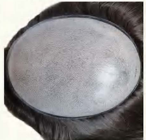
SPU Silicon Injected Skin 0.25mm