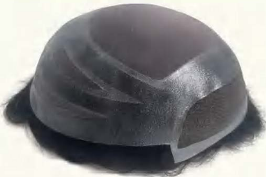
Ruit-4 (4 Holes)