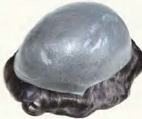
PU0406V Super thin skin 0.06mm with V-loops