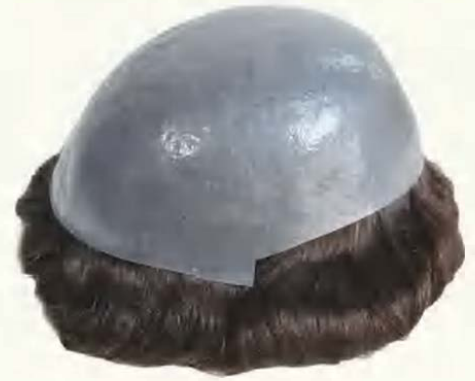
PU0608V Super thin skin 0.08mm with V-loops