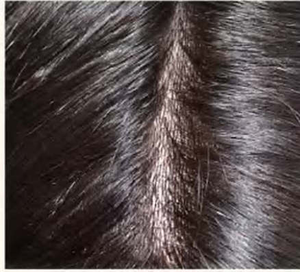
Single reverse knots