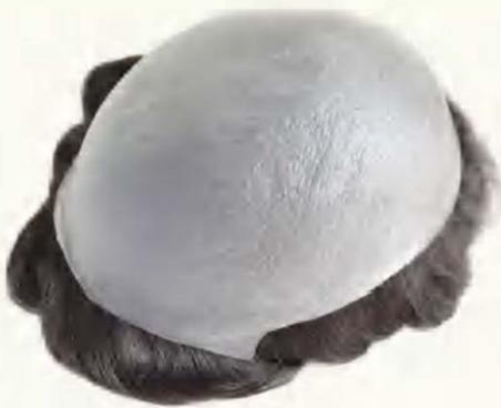
PU0204V Super thin skin 0.03mm with V-loops