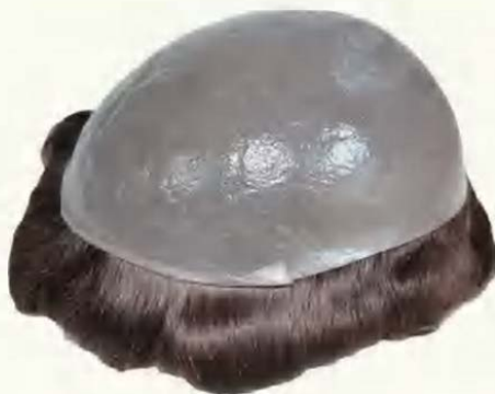
IPU0810 Super thin skin 0.10mm with Injected