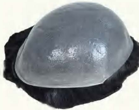
IPU1214 Super thin skin 0.12mm with Injected